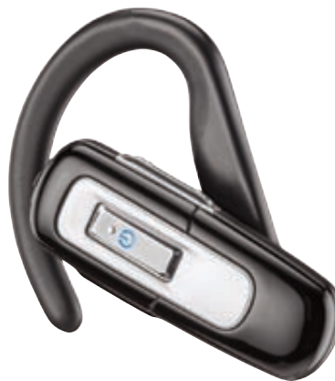
Plantronics Explorer 220 Black 75516-01

Now available in gloss black and sleek silver