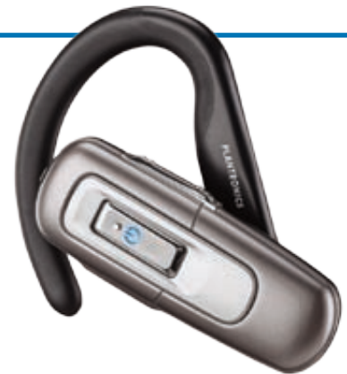
Plantronics Explorer 220 Silver 75637-01