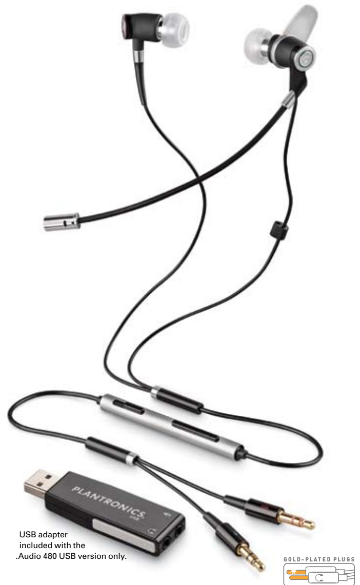
USB adapter included with the .Audio 480 USB version only.