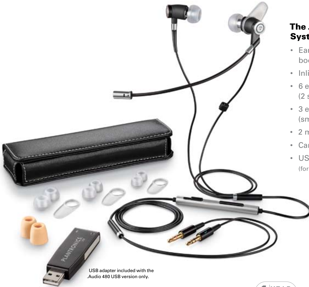
USB adapter included with the .Audio 480 USB version only.