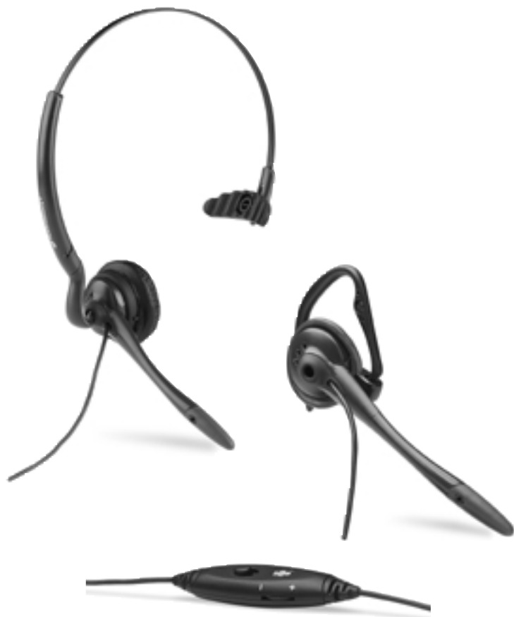
Easy volume and mute control (available on M175)