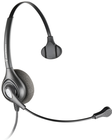
SupraPlus Monaural SDS 2490