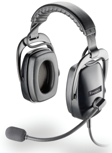
Ruggedized SHR 2301