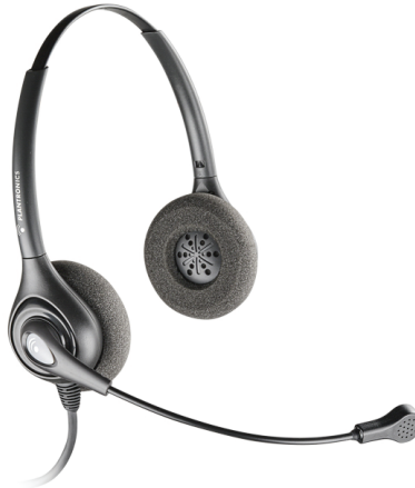
SupraPlus Binaural: Single Channel: SDS 2491 Dual Channel: SDS 2492